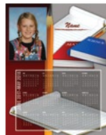
★ Bonus H 1 - 8x10 Calendar $15