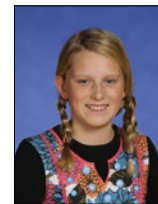
★ Bonus I 1 - 8x10 $15