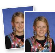
★ Bonus F 2 - 5x7 $15